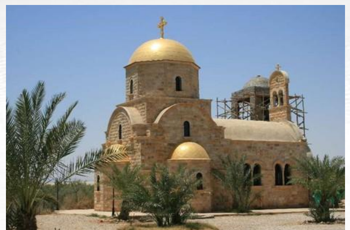
BET ANYA IS THE PLACE WHERE JOHN THE BAPTIST LIVED, WHERE JESUS WAS BAPTIZED AND WHERE ELIJAH WAS BORN INTO HEAVEN