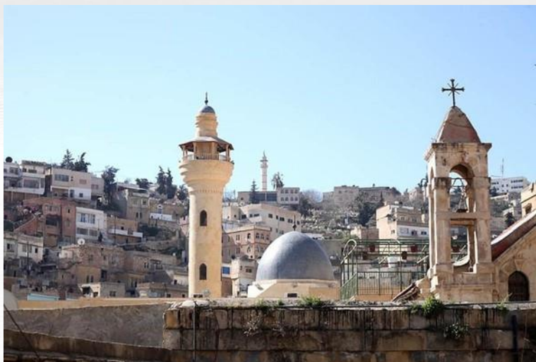
TOLERANCE AND RELIGIOUS COEXISTENCE

ECOTOURISM: ROYAL SOCIETY FOR THE CONSERVATION OF NATURE