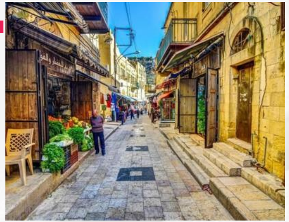
ANCIENT CITIES: ALSALT