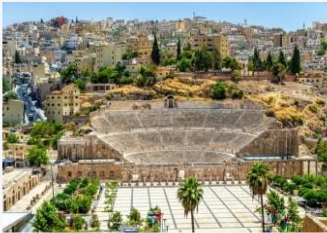
ANCIENT CIVILIZATIONS: ROMAN AMPHITHEATER