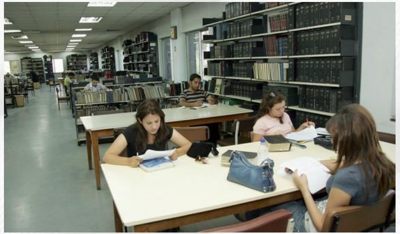
EDUCATION AND UNIVERSITIES