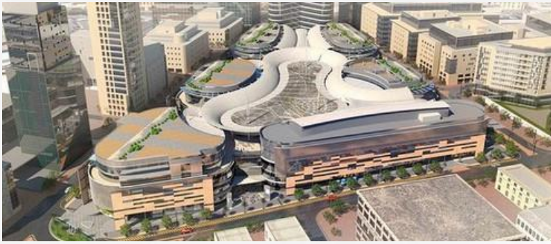
MODERN CITIES: AMMAN